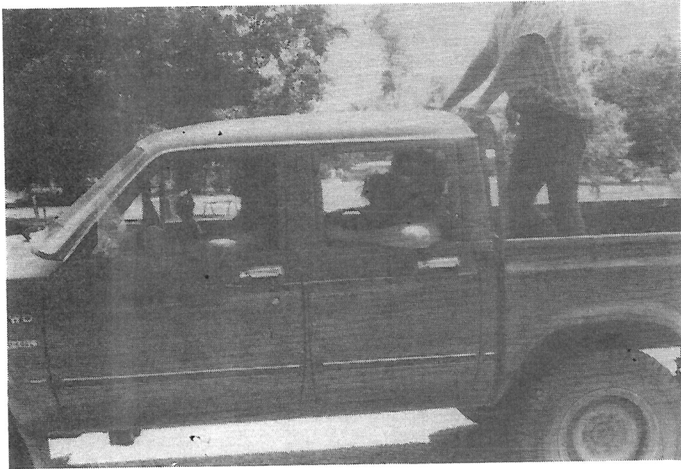
Carpenters on the move.

The Yarrabah Community Council has five work gangs under their authority at the moment, and these are the Road Gang, who are at present cleaning up Yarrabah's beach front; the Hygiene Gang; Parks and Gardens; Police and Carpenter Gang, (which is one gang we need to know about).